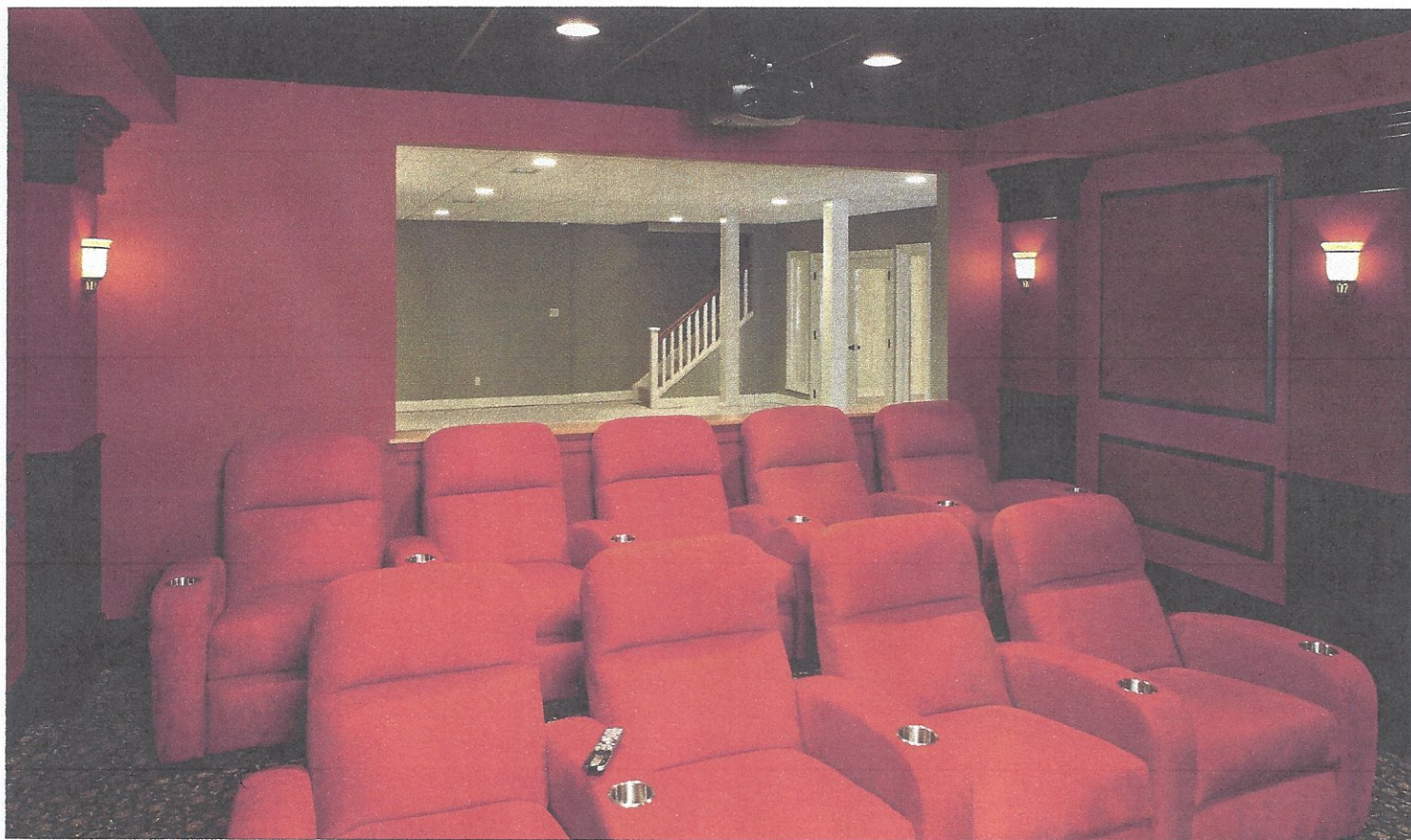
The rear wall was left partially open so that those seated in the bar area would be able to see the screen.

while they wanted it to be a dedicated room, they were concerned about how the room could be extended so that more people could see the screen when they hosted parties and large family gatherings. Dzedzy overcame this challenge by orienting the theater so that its rear was next to the bar counter outside of the room. "We opened up the rear wall of the theater to allow viewing of the 110-inch screen from both the bar stools and the lounge area next to the bar," he explains.