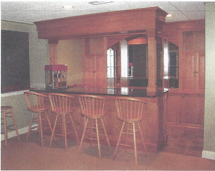
Media Rooms also constructed a bar area where guests can still view the theater screen. The bar was built in cherry wood with a natural finish.

But the award-winning theater is arguably the most impressive area of the basement. Home theaters are a welcomed addition to any home and are installed for many reasons. "The most popular reason is that many homeowners are parents of teenage or preteen children and want a place in their own home where the kids and their friends can congregate," says Dzedzy. "Another popular reason for home theaters is to use them as an escape. Many of our clients are professionals with stressful jobs. They like to watch a movie in the comfort of their own homes and without all the hassles of having to drive